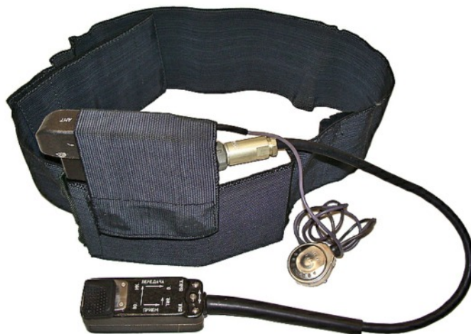
The Alycha was carried in a belt worn under the clothing.