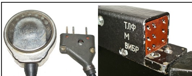
Covert speaker (left) ; 3-pt plug (centre), and socket panel for connecting speaker, microphone and vibrator.

Alycha (Russian: Алыча = Cherry plum) was a miniature fully transistorised body wearable covert VHF FM transmitter-receiver. It was primarily developed for covert surveillance, observations and special operations, intended to be concealed under the clothing worn on the waist carried in a belt, hence its curved shape. The remote control unit was similar to that used with other covert radios. (Neva, Anker and Kama) It provided a combined PTT and tone call function, on/off switch, channel selection and volume control. The remote control unit cable could be guided through one of the sleeves, carried in the hand, allowing full control of the Alycha. The rechargeable battery would slide under an angle in a slot on the right hand side of the radio giving the whole assembly a body shaped form. Engraved in the right hand side was the serial number (N2870 in the Alycha depicted in this chapter) and believed to be channel information. These were possibly organisation-group and channel numbers, see Appendix 3 for more details.